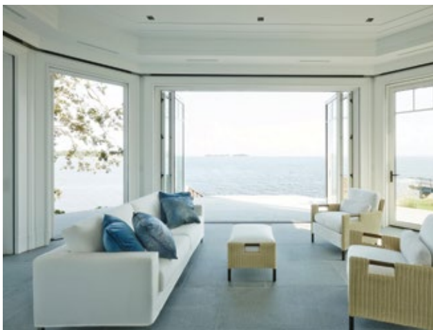
Sound Beach Accessory Building interior