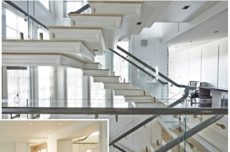
Sound Beach floating glass staircase (detail)

The interiors are a collaboration of Sound Beach Partner, Doron Sabag and the transitional design of Amy Hirsch Interiors. A seamless indoor outdoor integration is created with floor to ceiling windows in the double height living room which features linear fireplaces on opposite walls. A clean, transitional kitchen is designed with a porcelain tile floor, Calcutta counters and an interior glass window, which frames a signature Sound Beach floating back stair with glass rails.