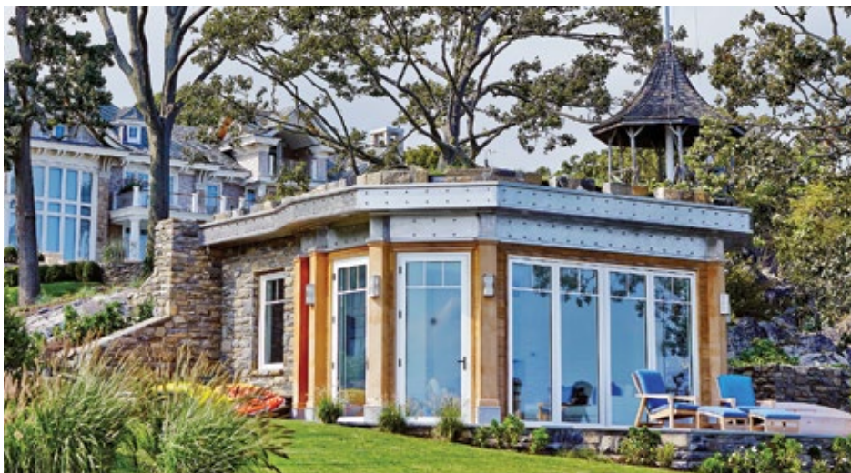
Sound Beach Accessory Building

At water's edge, a 500sf teak and steel retreat protruding from a natural rock formation won Sound Beach Partners another HOBI Award for BEST ACCESSORY BUILDING. This dockside gathering place features a planted roof and deck overlooking the water. Inside, there's an enchanting living room, kitchenette and shower.