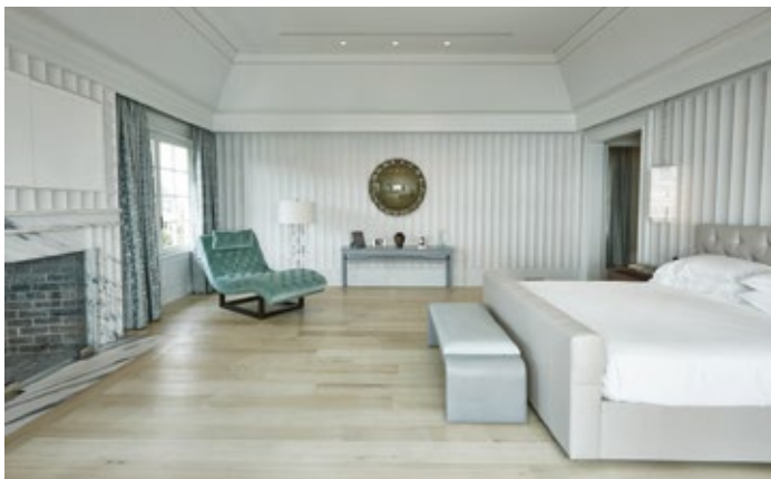
Sound Beach MBR

The sumptuous master suite features a unique beveled plaster wall, fluted Vermont Danby marble fireplace, and master bath with marble slab walls.