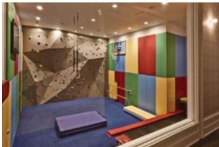
Sound Beach rock climbing wall

The home is equipped with a nursery school classroom, a rock climbing wall, and a two lane bowling alley. For the adults, there's an air conditioned wine room with radiant heated floor and temperature controlled red/white wine storage. Even the mechanical room is stunning.