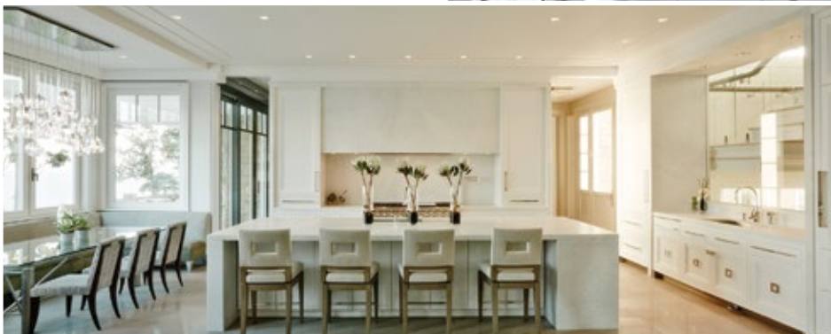
Sound Beach kitchen

The sumptuous master suite features a unique beveled plaster wall, fluted Vermont Danby marble fireplace, and master bath with marble slab walls.