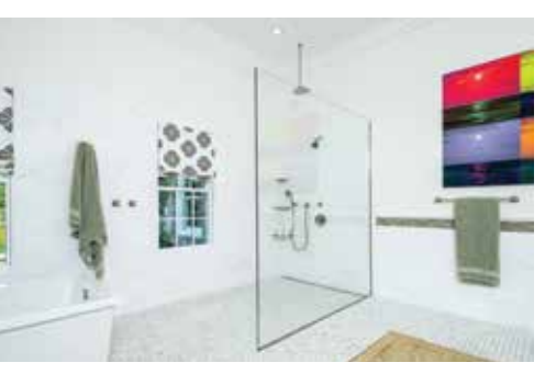
Back Country RAM bath

This year's winning homes embrace the outdoors as never before. They feature walls of charcoal framed glass doors that fold open to bring the outdoors in.