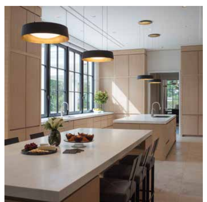
Sound Beach Kitchen

year's winning builders used low profile drywall detailing on ceilings and trim work, flat panel cabinetry with linen finish, quartz counters and floating shelves. We saw faux finishes over wood stain to give it an aged look, and matte finishes on rift sawn floors. In bathrooms, tiled floors were seamless with infinity drains and light wells in the shower. Walls and floors were covered in marble slab or large format porcelain tile.