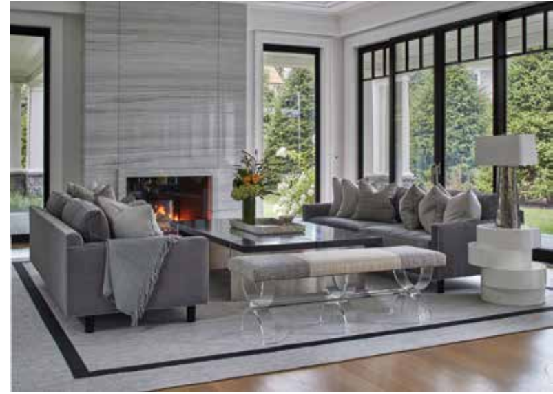
Sound Beach living room