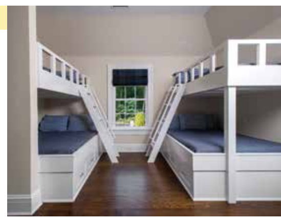
Back Country RAM bunk beds

Bunk beds are in vogue, and sliding barn doors have morphed from reclaimed wood to anodized metal and frosted glass, and they are being creatively utilized for everything from patio entries and walk-in closets to window shutters.