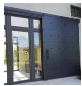
Sound Beach barn door