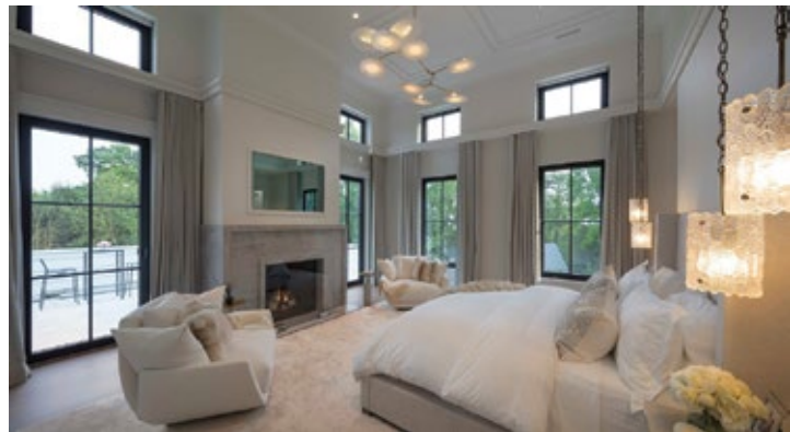
The spectacular two story master bedroom with stacked windows, full length balcony and fireplace by Fairview Hearthside.