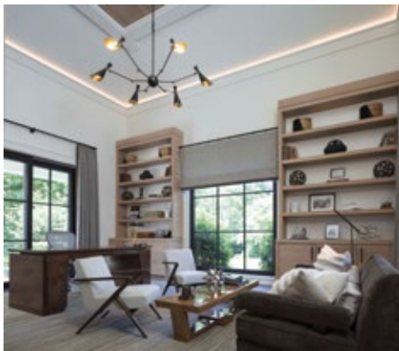
The dramatic two story cove lit office with light rift sawn oak bookcases.