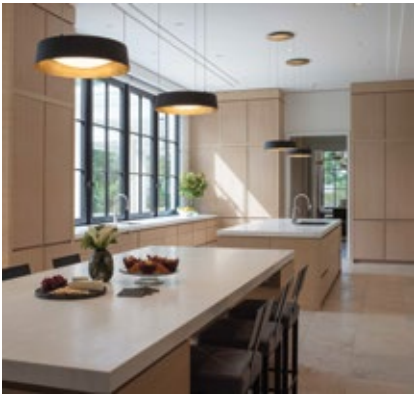
The striking kitchen is outfitted in floor to ceiling rift sawn oak slab cabinetry