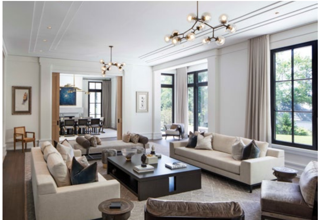
The open living room, dining room and family room are separated by rift sawn oak pocket doors.