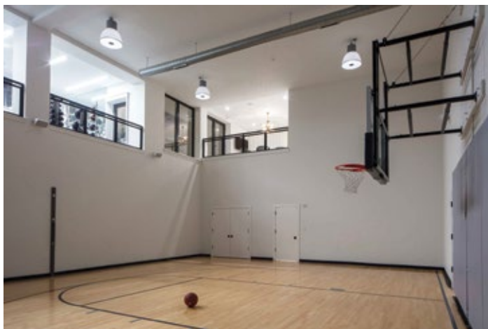
A 26 foot high basketball court in the lower level is complemented by a home gym with sauna, bunk room and lounge area.