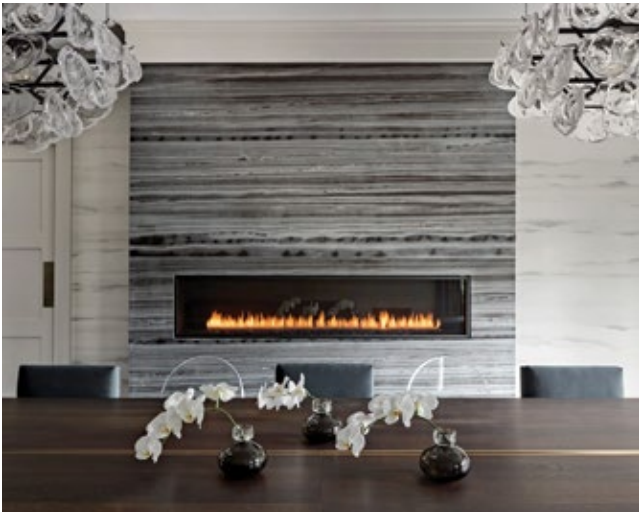
In the dining room, a striking floor to ceiling marble slab surrounds the modern linear gas fireplace from Fairview Hearthside.

Innerspace Electronics designed and installed the home's Savant Home Management System with multi-zone audio & video, Lutron lighting and motorized shades, security and HVAC control integration, a security camera system and pool & spa control for on or off-site control, as well as driveway gate integration, and retractable bug screen control.