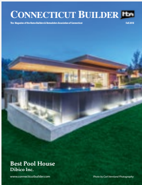
On the cover - Dibico Inc's spectacular 38,000 sf custom home in Greenwich, features cascading terraces and multiple outdoor rooms, indoor and outdoor pools, as well as this fabulous pool house with floor to ceiling glass and infinity edge pool and spa.

COVER STORY HOBI Winning Builders Show Us What's HOT in New Construction ...6